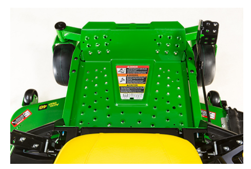
Comfortable operator's platform

Large foot platform helps the operator remain comfortable and secure: