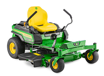
ZTrak™ Z315E Mower shown

ZTrak Mowers are designed around a heavy-duty formed and welded steel frame for strength and reliability.