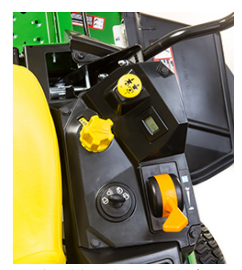
Color-coded controls are easy to identify

The online sales manual should always be referenced and checked to ensure accurate information is being conveyed to the customer. Always download the most current information before visiting a customer and always use the online version if Internet access is available. This download is not intended for distribution. Product features are based on published information at the time of publication and are subject to change without notice. All trademarked terms, including John Deere, the leaping deer symbol and the colors green and yellow used herein are the property of Deere & Company, unless otherwise noted. Availability of products, product features, and other content on this site may vary by model and geographic region.