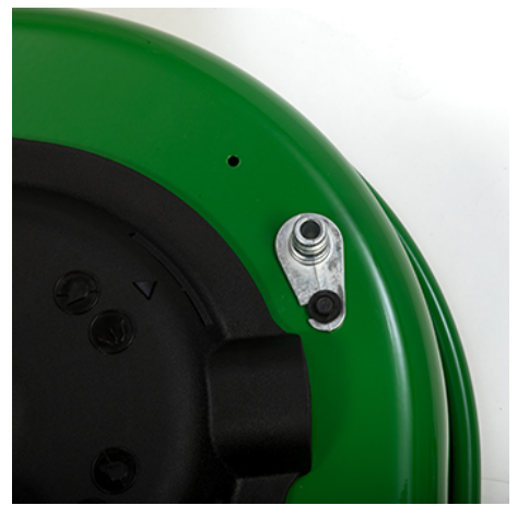
Mower wash port

The flat-top design reduces places for material to build up and makes material that does collect easy to remove.