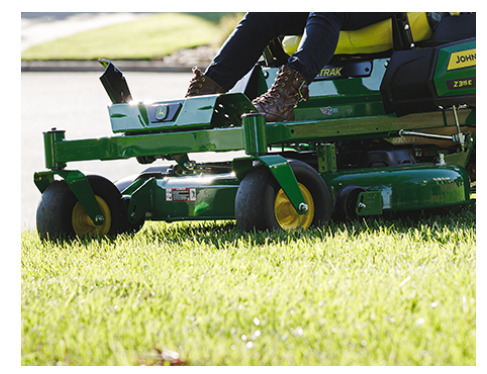
42A Mower Deck

The 107-cm (42-in.) Accel Deep Mower Deck is a stamped-steel, deep, flat-top design that delivers excellent cut quality, productivity, cleanliness, durability, and versatility. Optimal performance and dispersion of clippings is provided, even at faster mowing speeds or in tall grass: