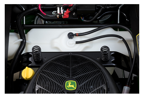
Seat suspension springs