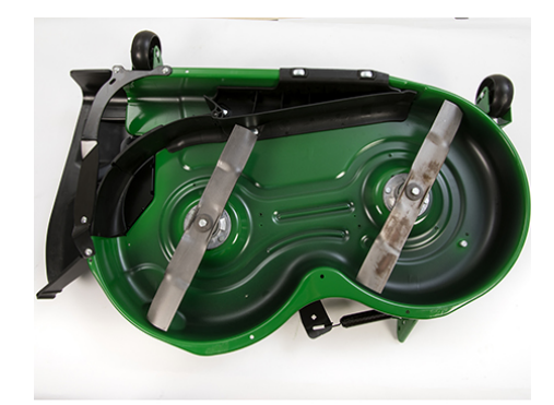
MulchControl baffle open