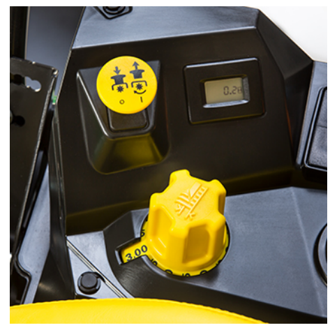
Mower deck lift/cut-height adjustment