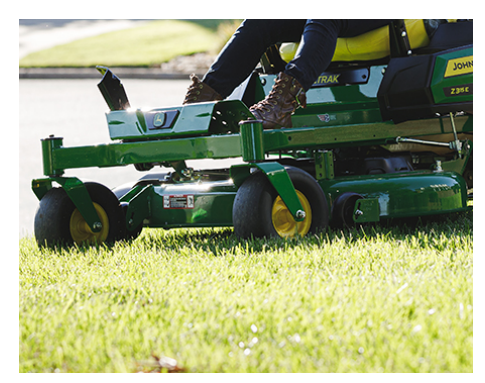
Accel Deep 42A Mower Deck

The flat-top shape of the deck stamping is optimal for keeping itself and the operator clean: