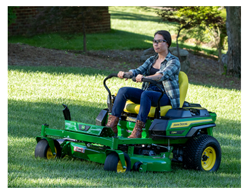
ZTrak™ Z315E with Accel Deep 42A Mower