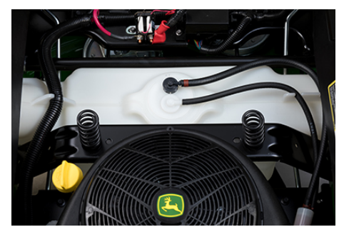
Translucent fuel tank

Translucent fuel tank displays fuel level.