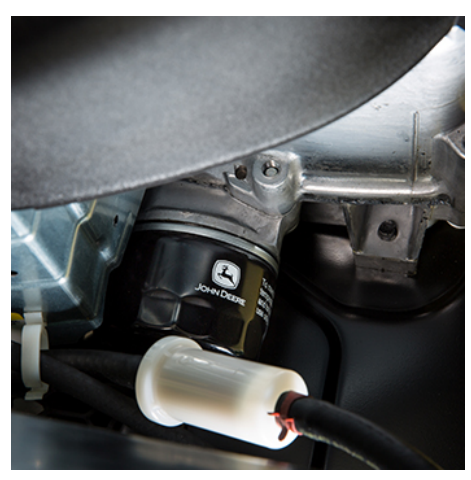
Replaceable oil filter and fuel filter (shown on Z315E)

The engines are easy to service, including changing the oil and the oil filter and servicing the air filter.