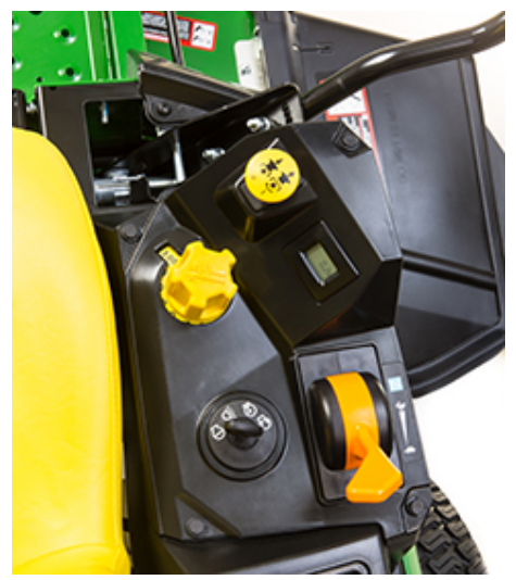
Control panel (shown on Z315E)

The operator control panel is conveniently located and easy to use. The following instruments and controls are included: