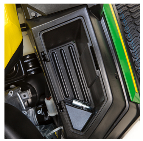
Open storage compartment

The cup holder is designed to hold common cup sizes securely.