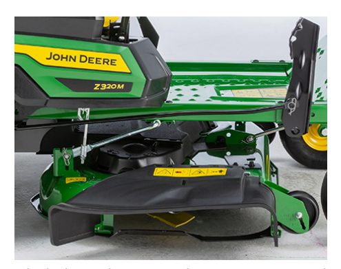
Side-discharge chute on Accel Deep 42A Mower Deck

Deep mower-deck stamping gives high productivity, which gets the job done fast. It allows the cut and suspended material room to exit the deck quickly, reducing the amount of re-cutting so more power is available to process incoming grass: