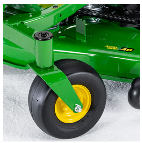
Front caster wheel

A shock absorber is included to dampen the movement of the control levers so any operator can make smooth, controlled turns.