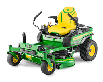
ZTrak Z320R Mower

The styling of ZTrak Mowers is functional and attractive to appeal to residential owners who value product appearance and the easy, comfortable operation that comes with thoughtful control designs: