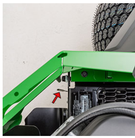
Tow-valve control (left side shown)

Four-bolt hubs provide a reliable and convenient wheel-mounting system.