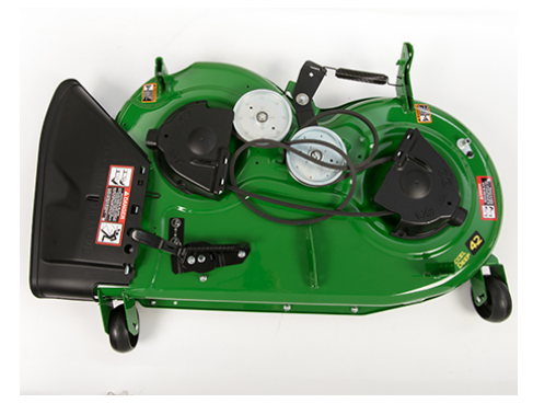
42A Mower Deck top (shown with optional MulchControl)