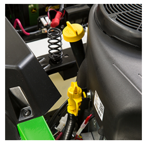
Engine oil check/fill tube and oil-drain tube

A 12.1-kW at 3000 rpm, V-twin engine provides plenty of power and torque to handle tough mulching, mowing, and bagging conditions: