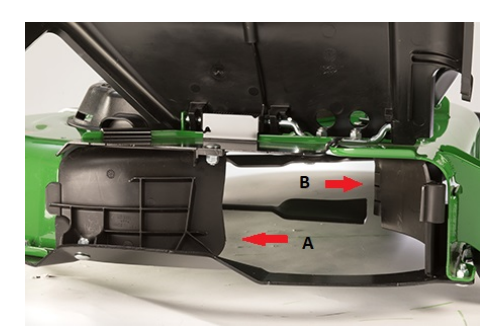
Rear MulchControl baffle (A) that must be removed for bagging