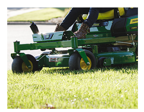
Accel Deep™ Mower Deck

The engines are easy to service, including changing the oil and the oil filter and servicing the air filter.