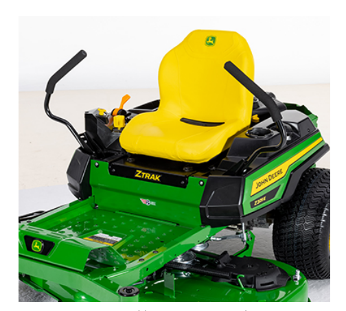
Motion-control levers in outward position

• Motion-control levers must be in the outward position for the engine to crank.