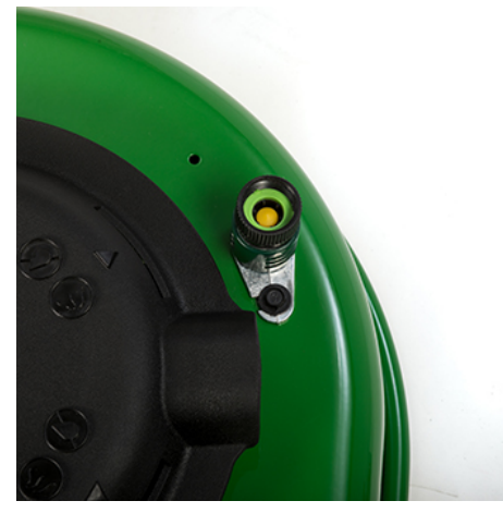
Mower wash port with locally purchased hose connector

A wash port is provided to make cleaning the underside of the mower deck easy.