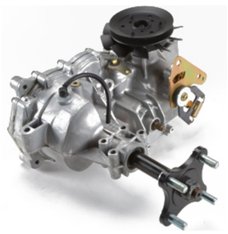
Hydro-Gear EZT transmission