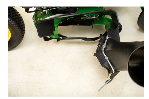
Rear MulchControl baffle removed to allow for chute installation

The 42A Mower Deck is designed for maximum versatility, providing the greatest ease in changing from one mower discharge mode to another: