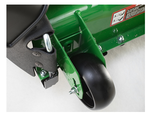
Mower wheels are double captured

The 42A Mower Deck has strong spindle pockets, to keep the blades aligned, even after years of tough service: