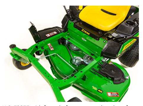
U.S. Z325E with foot platform removed to show frame

The ZTrak Mower frame is constructed of heavy-duty steel tubing for long-term durability: