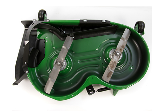
42A Mower Deck underside (shown with optional MulchControl)

Deep mower-deck stamping gives excellent cut quality. It allows the cut and suspended material room to exit the deck without getting recut: