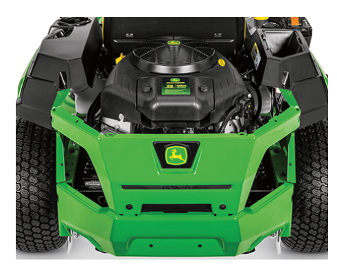
Rear engine guard