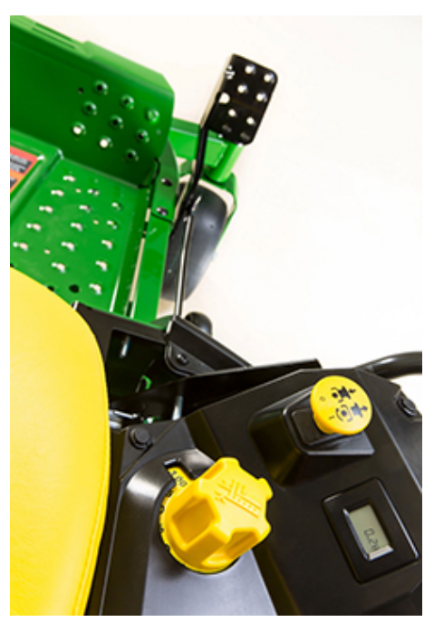
Foot pedal lift and cut-height adjustment