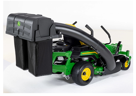
Z315E equipped with optional rear bagger

An optional 230-L (6.5-bu) cut-and-throw rear bagger material collection system (MCS) is available for use with the 107-cm (42-in.) Accel Deep Mower. It provides an efficient means of collecting grass clippings and leaves.