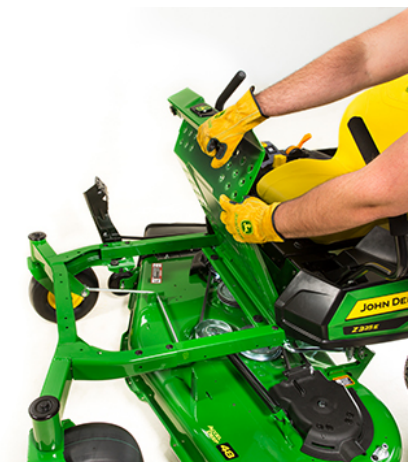
Footrest is easily removed for easy access to mower

The footrest area is hinged and easily raised for service to mower deck: