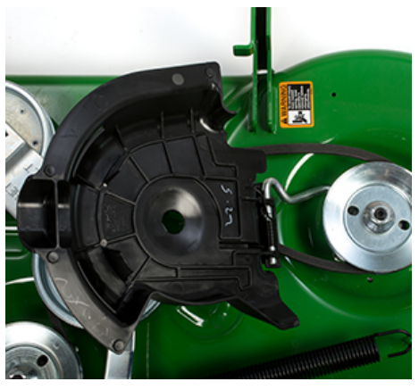
Flip-up cover for easy spindle-pocket access

Accel Deep mower decks have several features that make them easy to service: