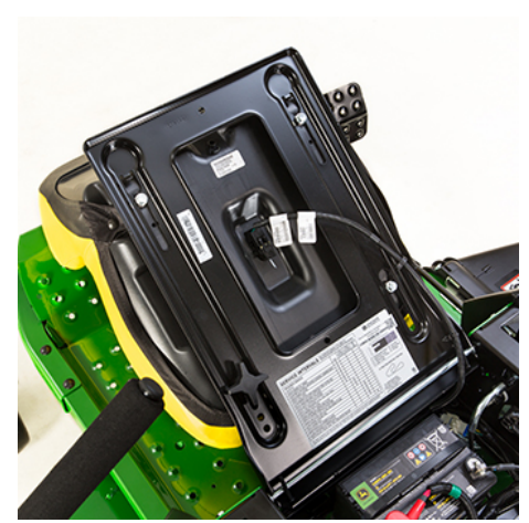
Interlock switch is located under the seat

• Motion-control levers must be in the outward position for the engine to crank.