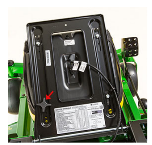
Seat fore-aft adjustment

Two steel coil suspension springs under the seat absorb shocks when traveling over rougher areas to provide a smoother ride.